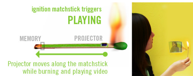
figure 5. Light up the playing side of a PY-ROM match to replay the recorded memory with a micro-projector.

To play the recorded memory, the user swipes the playing side (colored green) of the match, lighting it on fire and triggering the micro-projector and audio player to play the recorded video (figure 5). Similarly, the projector will move down along the matchstick in response to the heat, avoiding destruction from the fire. The time the playing side of the match can be burned stands for the length of the recorded video the user can see. If user extinguishes the fire in the middle of the playback, the remaining content can be played the next time the PY-ROM stick is ignited.