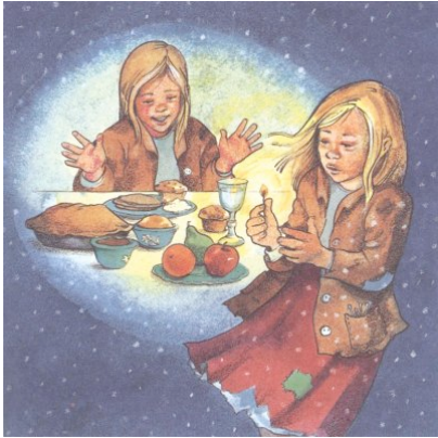
figure 2. “She struck another match against the wall. It burned brightly, and when the light fell upon the wall it became transparent like a thin veil, and she could see through it into a room. On the table a snow-white cloth was spread, and on it stood a shining dinner service.” [2] (image from [17])

itself associated with the channeling of precious memories; in Hans Christian Andersen's tale "The Little Match Girl" [2], the light of the matchstick is a fleeting projection of memories and hopes (figure 2).