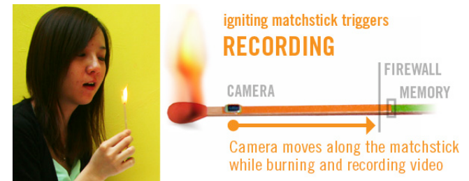
figure 4. Light up the recording side of a PY-ROM match to record a precious moment with a micro-camera.

To capture a memory or message, the user swipes the recording side (colored orange) of the match, lighting it on fire and triggering the embedded camera and microphone to start recording. As the match burns, the recording devices move down along the length of the matchstick in response to the heating from the burning until the recording side is burnt out (figure 4), i.e. the time the recording side of the match can be burnt is the length of video the user can record. After burning the recording side, the recorded video is stored in electronic memory located at the middle part of the matchstick, waiting to be accessed by lighting the playing side of the match.