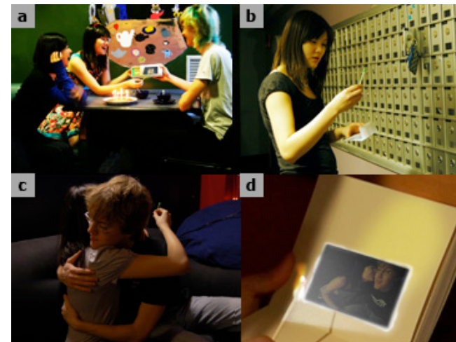
figure 6. (a) Playing the PY-ROM matches with captured blessings from friends at the birthday party for everyone's enjoyment. (b) Receiving a mystery PY-ROM gift in the mailbox. (c)(d) Lighting up a PY-ROM farewell gift to remind the past moments.

to the birthday person. With a micro-projector, they can enjoy the recorded message all together. In addition, using such an ordinary-looking object, they can also record the happy moment more naturally during the birthday party. 2) A recorded match can even be a mystery surprise as a gift sent by physical mail, to share a message or event invitation with friends. 3) It can also be presented during a moment of farewell so that the departing friend can play and recall the precious memory from before. This ritual action can help users reconnect with their friends. All in all, ordinary but special moments can be uniquely captured and played using a match-like device, along with deeper meanings.