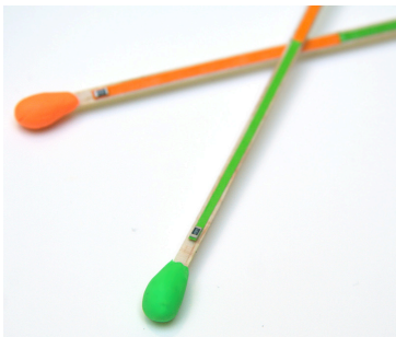
figure 1. A matchstick-like video capture and storage device that will burn itself away after being used.

MIT Architecture 20 Ames Street Cambridge, MA 02139 USA cchiu@mit.edu