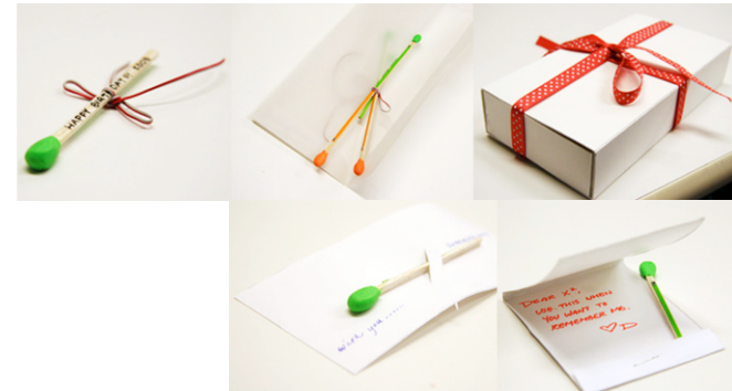
figure 8. Different ways to annotate and store the recorded PY-ROM matchsticks as ordinary physical objects.

When a match has been recorded with a memory, we do not automatically annotate any information such as date, time, or location on it. We want to give people the freedom to manually label it with their own styles, e.g. write notes on the stick, attach a paper tag, place in a special box, etc. (figure 8) This may enhance their relationship to the device, bring surprises, and even encourage people to ponder its meaning to them. They might try to recall their memory before playing, and to figure out the content, instead of just quickly browsing digital files using computers, cameras, cell phones, or attached files in emails as we do now.